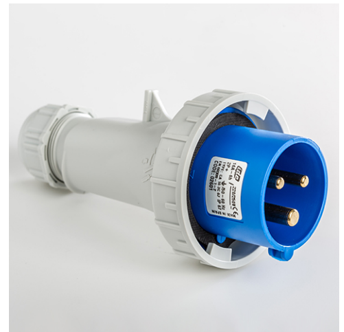
The colour of the picture does not match the actual image.